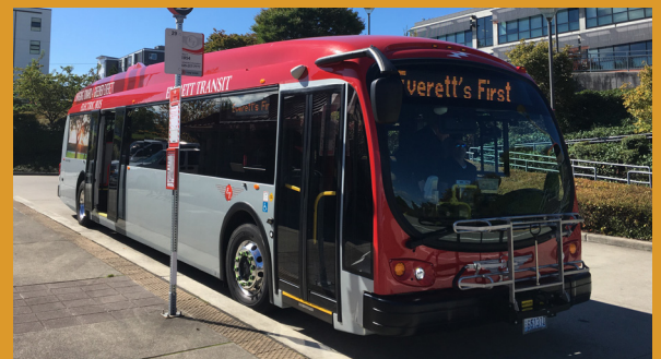
More communities would see many more electric buses like this one on the road in the City of Everett

Higher efficiency refining operations: The program credits refineries for cleaning up their operations – improving local air quality and cutting carbon pollution.