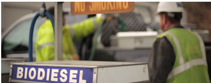
A transition to clean fuels is good for our local economy supporting low-carbon fuel producers in WA state.

A greater reliance on clean fuels in Washington will support rural economic development by relying on our local clean fuel resources, such as dairy waste, forest residue, food waste, and wastewater treatment facilities. Washington already supports over 1,700 jobs in the clean fuels industry. By implementing a Clean Fuel Standard, our state can become even more competitive.