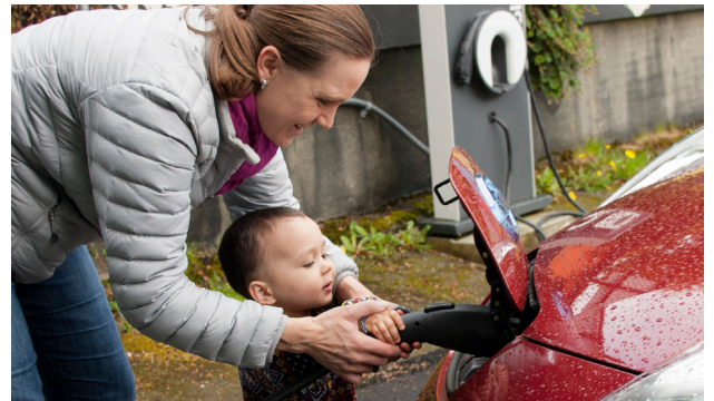
A clean fuel standard increases investments in transportation electrification infrastructure.

Leading public health organizations like the American Lung Association and Puget Sound Clean Air Agency view a Clean Fuel Standard as one of the most important ways to improve public health and transition our transportation to cleaner sources.